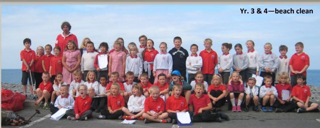
Yr. 3 & 4—beach clean

A big thank you to Pob and Dafydd for a fascinating morning.